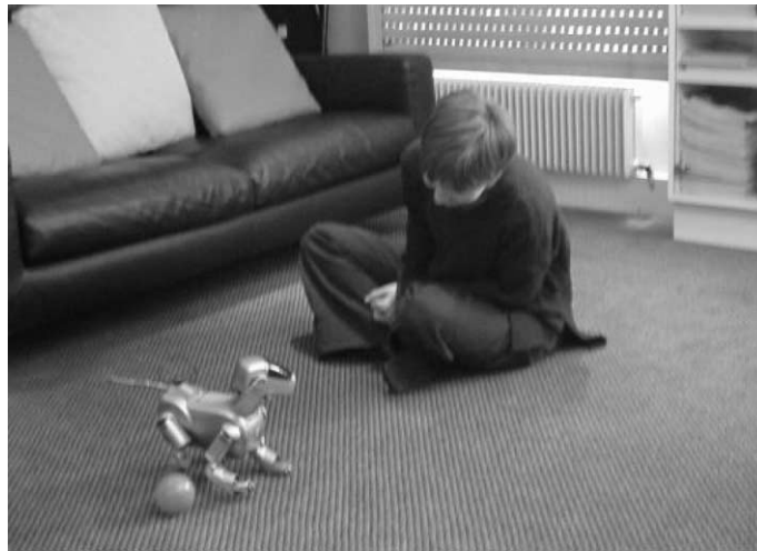
Fig. 3. Test sessions with naive users.

Usually, the trainer is not the robot designer. For having efficient clicker training sessions, the schema-hierarchy needs to match with the particular way the trainer perceives whether an action is going in the right direction or not.